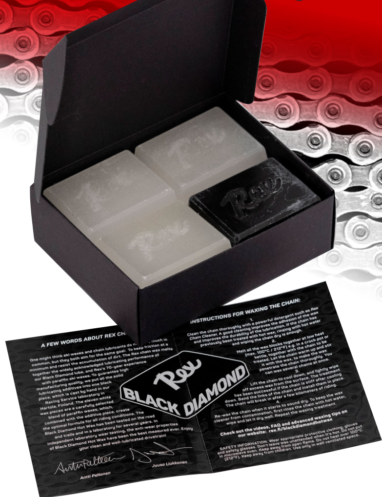
#909 Black Diamond Hot Wax 480g