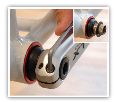
3. Install the crank. If there is side-to-side play, you may need 24 mm spacer(s) on the outside and/or additional 30 mm spacer(s) installed on the inside of the adapter. Tighten to manufacturer's specification. Crank should spin freely.

2. Insert the left side adapter. Spacers can be placed on either side to center cranks in bottom bracket.