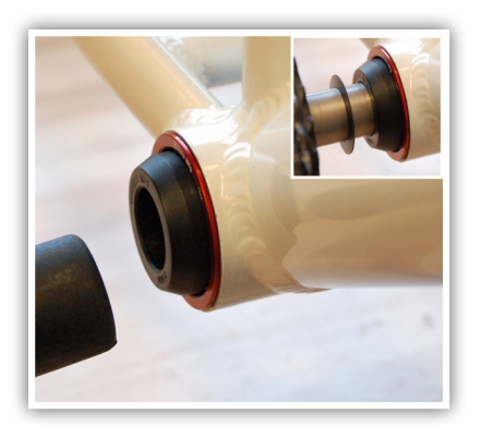
Insert the right side adapter into BB30 or PF30 Bottom bracket by hand. Note: BB30 and PF30 dust covers can be removed from the system or left in place. If you choose to use them with the BBUNIV-SHIM, place them between the bearing and the adapters on both sides. Right side spacers (24mm I.D.) fit on the BB spindle between the right side adapter and the right crank arm.